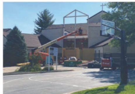
June 19, 2024 - Crew prepares to remove metal frame.