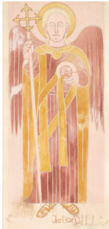
Saint Michael Egyptian 2nd-6th century AD