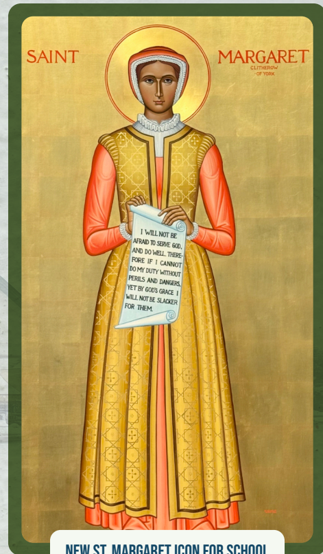
NEW ST. MARGARET ICON FOR SCHOOL