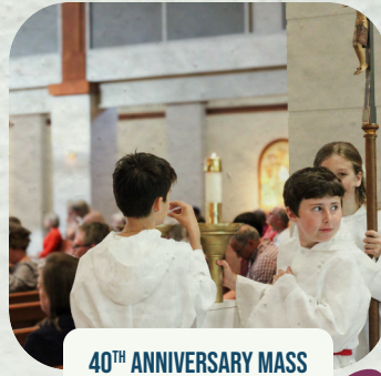
40 TH ANNIVERSARY MASS

The Evangelization Team, consisting of Adult Faith Formation, Youth Faith Formation, and Communications, began collaborating to offer a faith focus for the year across the parish. The fruits of these efforts can be most easily seen by checking out the Domestic Church Corner of the bulletin. For the coming year, we hope to continue to develop deep and meaningful programs to engage our youth and families.