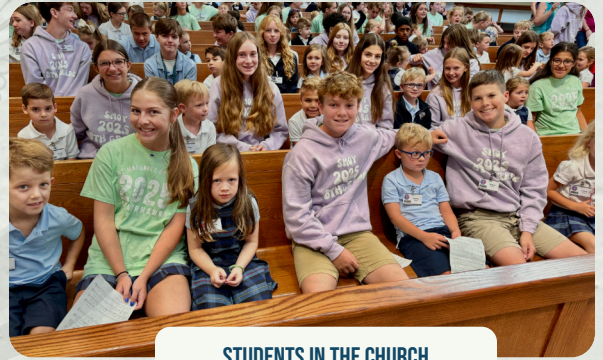
STUDENTS IN THE CHURCH

Our 2023/2024 school year was themed "Go Out To All The World And Tell The Good News". We were certainly full of good news last year at St. Margaret of York School. SMOY was blessed with welcoming 584 students into the school! We received the wonderful honor of being named a 2023 National Blue Ribbon School, and all of us are excited to see the great plans God has for St. Margaret of York School as we embark on the 2024/2025 school year with great growth and opportunity ahead. Our 626 students will focus on this year's theme, "We Are All God's Children." Our school is going through a beautiful renovation and will be a place where our students, teachers, and staff gather to grow in knowledge, faith, and community.