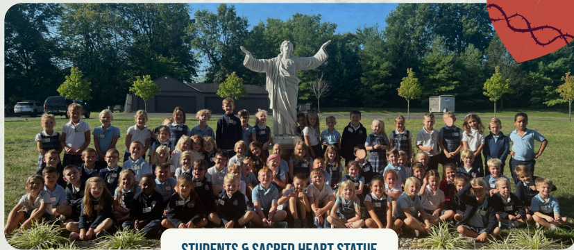
STUDENTS & SACRED HEART STATUE