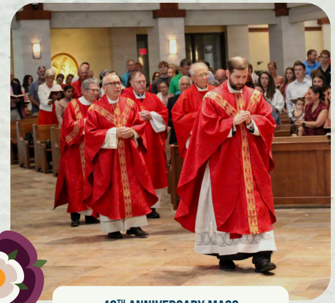
40 TH ANNIVERSARY MASS